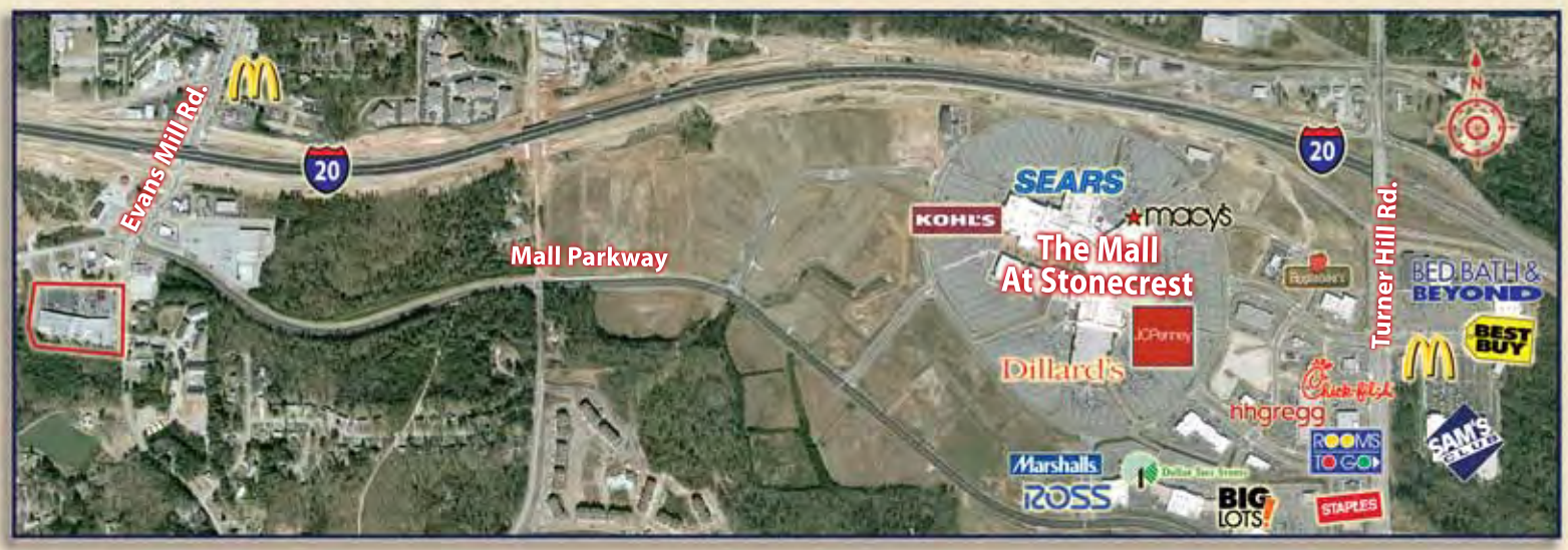
Information contained herein has been obtained from a reliable source. The Malon D. Mimms Company has no reason to doubt its accuracy, but we can not guarantee it. ©2020